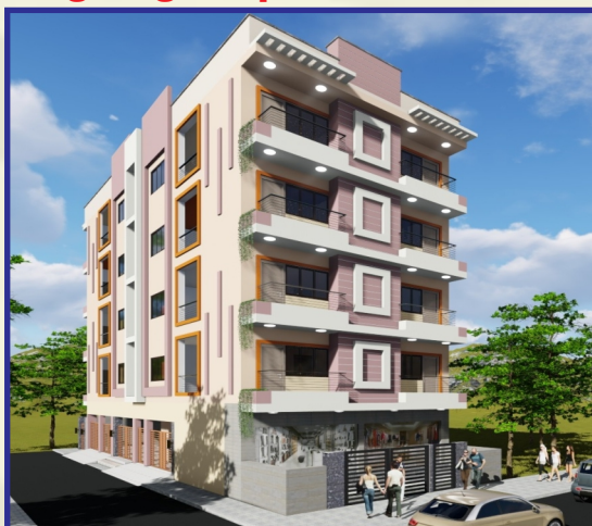
Galaxy Heights Katari Hill Road, Gaya