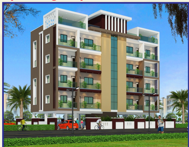
Galaxy Palace Patliputra Colony, Patna